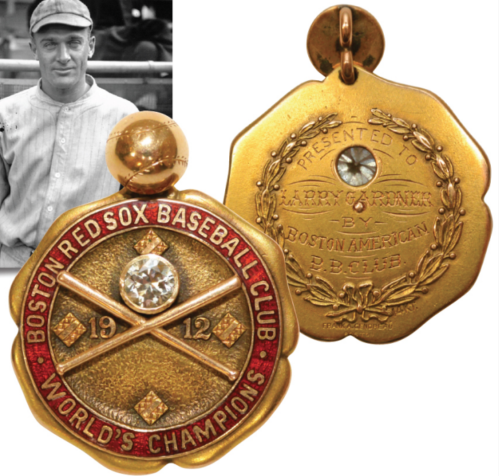
Larry Gardner's 1912 Boston Red Sox World Series Championship player's watch fob. From a family collection of Gardner's Championship jewelry. Accompanied by family Letter of Authenticity

The jewelry consigned to the auction includes Larry Gardner's 1912 Boston Red Sox player's Championship watch fob , his 1916 Red Sox Championship pocket watch, and his Cleveland Indians 1920 World Series Championship player's pin , which is the only known example to enter the marketplace.