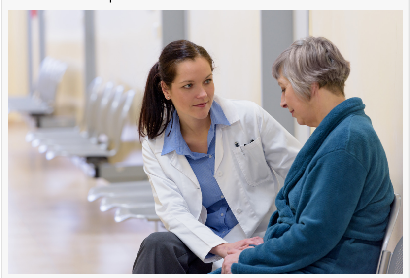
When you suspect foodborne illness, encourage your doctor to consider a foodborne pathogen as the cause of the problem