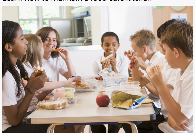
Learn how to pack food-safe school lunches