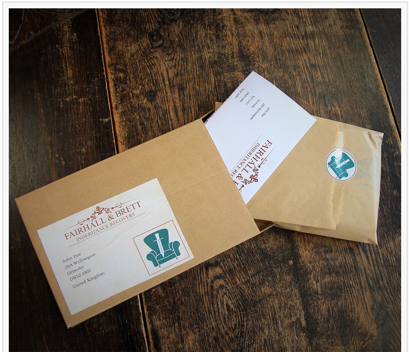
Arriving through the mail...

“Murder mysteries started out as mini-series in newspapers and magazines” said Jo. “I see cosykiller as the new generation of periodical plots. It feels like we’ve gone full circle and back to the roots of crime writing.”