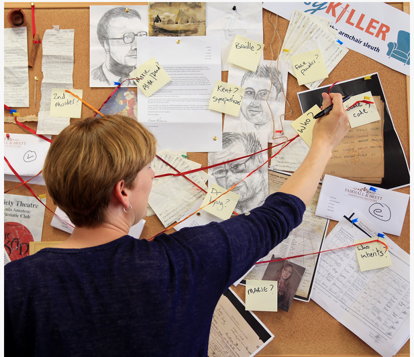
Puzzling out last year's story...