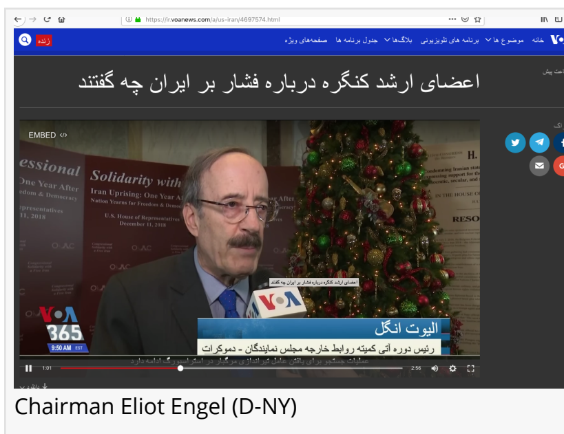
Chairman Eliot Engel (D-NY)