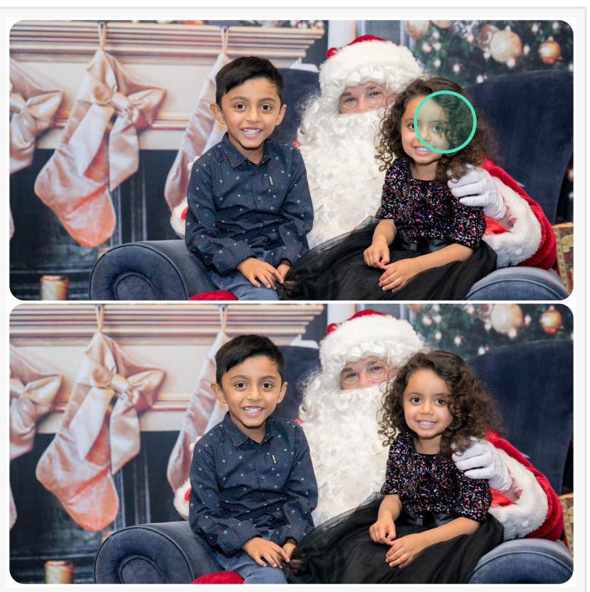
Phixst fixed this little one's curls