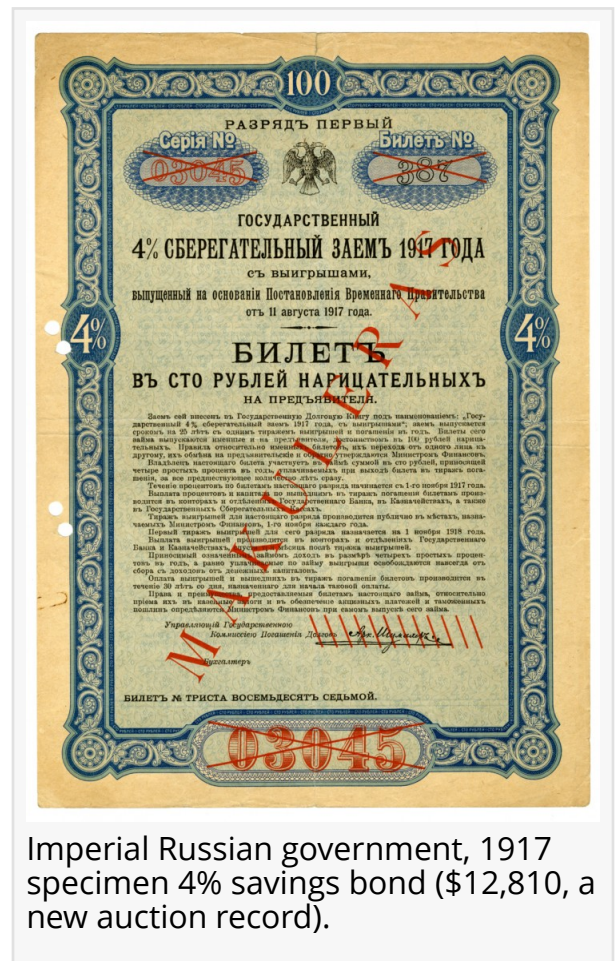
Imperial Russian government, 1917 specimen 4% savings bond ($12,810, a new auction record).

The December 3rd session started out with early U.S. stock certificates highlighted by a 1798 Bank of Baltimore stock certificate hammering for $488 followed by future modern classics such as a rare Specimen 1973 Berkshire Hathaway Inc. stock certificate with a Warren Buffet Facsimile signature selling for $488 and an Amazon specimen stock certificate with a facsimile Jeff Bezos signature garnering $550. Three different World War I Canadian 1917 War Bonds hammered $1160, $670, and $1040 bids respectively. Worldwide scripophily included numerous early European as well as New World classic scripophily. A Cuban, 1791 Accion De La Real Compania De La Habana bond sailed away for $2,200; a Danish West Indies Company 1778 issued bond sold for $1,220; a Puerto Rico 1876 Treasury Bond for Indemnification of Slave Owners hammered for $1,464; Spanish Scripophily was highlighted by 3 different classic share