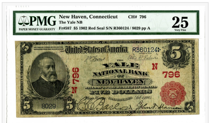
Yale National Bank of New Haven, Conn., 1902 PB, $5, Charter 796 ($3,900).