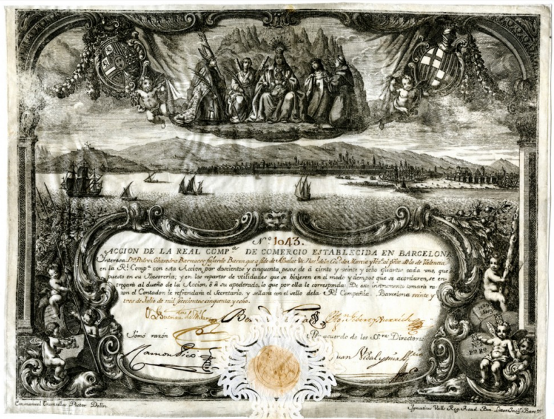
Real Compania de Comercio Establecida en Barcelona, one share ($3,900).

World notes were highlighted by an Australia, 1941 Camp Seven Bank Hay Interment Camp scrip note hammering for $4,880; A 1905 DWI, National Bank of the Danish West Indies $100 Proof hammering for $3,290; and a rare and possibly unique Colombia Specimen Banknote trio from Medellin, Senores Fernando Restrepo & Hijos, all ND (1893) issues hammering for a total of $2,970 to the same astute buyer.