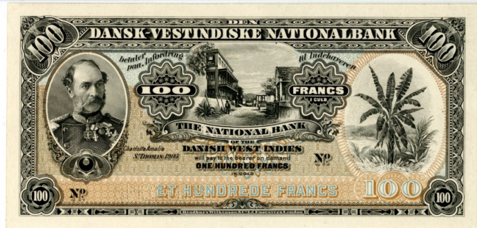
National Bank of the DWI, 1905 proof banknote ($3,240).