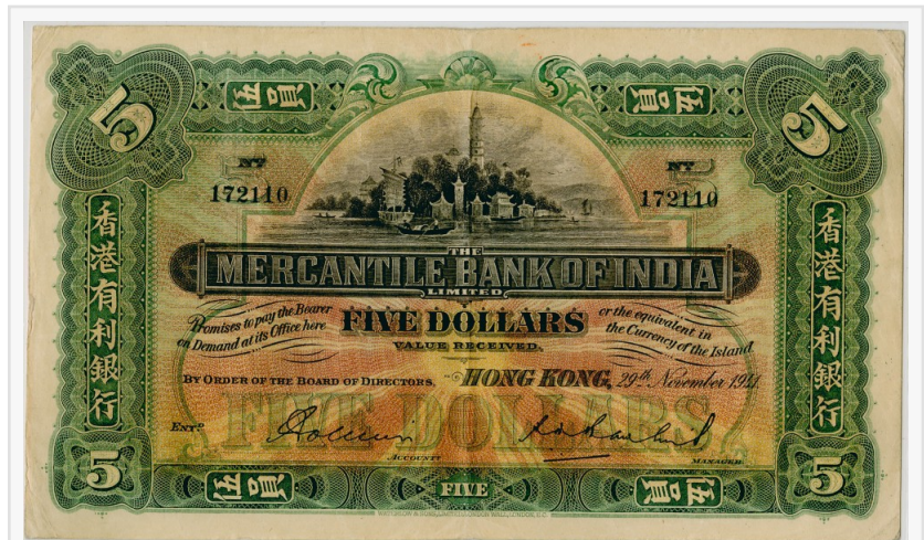
Mercantile Bank of India, 1941 issue banknote rarity ($5,100).