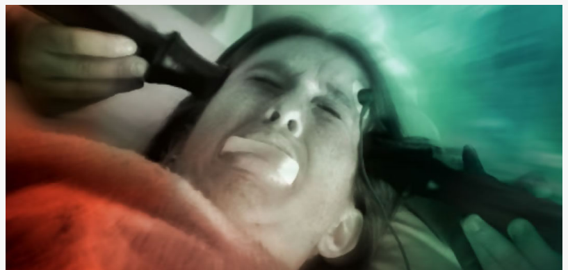
Ban Electroshock (ECT) Device Being Used on Children, the Elderly and Vulnerable Patients