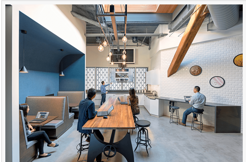
Formaspace Office Installed Hand Crank Custom Table

Now you should investigate what other companies in your industry are doing to discover any 'best practices' that you can learn from. The requirements for an architect's office will be as different from a software company as the office of a law firm will be from a call center, so inform yourself. Take tours of other well-regarded offices, or use social media, Glassdoor and YouTube to learn about current office layout trends. Collect your thoughts by creating a large "mood board" with pinup suggestions that you have collected. These notes will be invaluable in working with your space planner or architect.