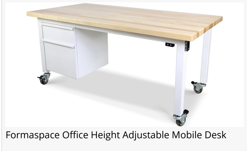
Formaspace Office Height Adjustable Mobile Desk