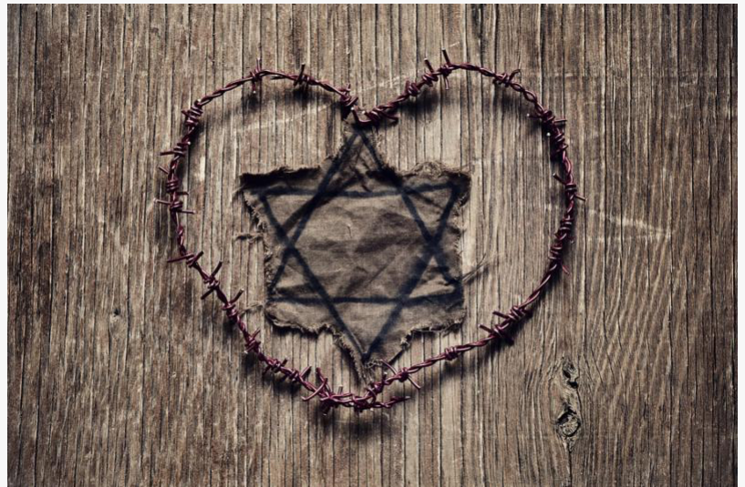
International Holocaust Remembrance Day

TAMPA, FLORIDA, UNITED STATES, December 24, 2018 / EINPresswire.com/ -- The Citizens Commission on Human Rights (CCHR) of Florida, a nonprofit mental health watchdog organization dedicated to eradicating psychiatric abuses, will be participating in an event to commemorate International Holocaust Remembrance Day on Sunday, January 27, 2019 held the Church of Scientology in Tampa, Florida.