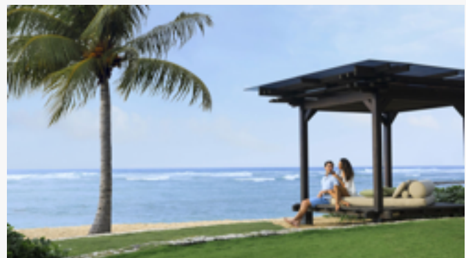
Romance by the Sea, the romantic allure of the island