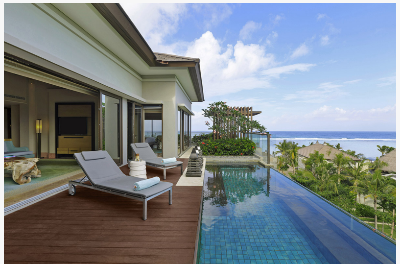
Luxurious suites and expansive villas for your romantic escapes