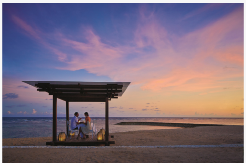
Romantic dinner by the Indian Ocean

Taking inspiration from stunning natural surrounds around this best resort in Bali , where the sapphire water of the Indian Ocean meets Bali's golden shores, romantic dinner by the sea is a private dinner served at a beachfront gazebo. Commencing at sunset, a pastel hued sky makes a dreamy backdrop, while a fragrant rose bouquet, bottle of perfectly chilled Champagne and beautifully decorated table set the scene for an evening of absolute romance.