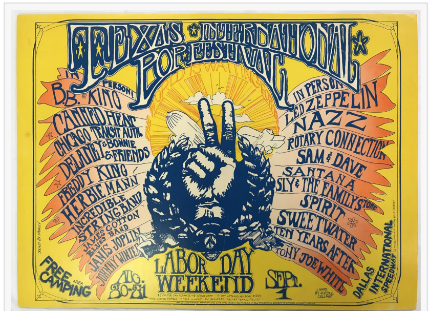
International Pop Festival (Dallas, Texas) rock poster from 1969, featuring Led Zeppelin.

Philip Weiss Weiss Auctions +1 516-594-0731 email us here