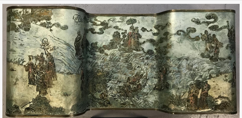
Rare, unusually shaped coffee table by American designers Philip and Kelvin Laverne (est. $20,000-$30,000).

Day 2, on January 24th, will be an estate sale, featuring paintings, jewelry and more. In addition