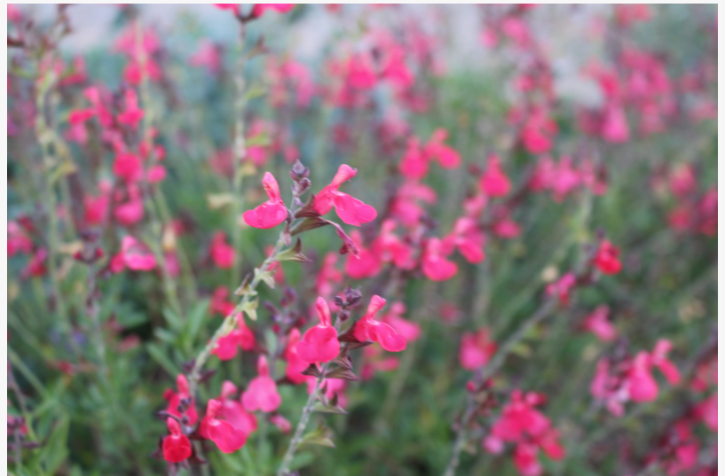
The brilliant flowers of FlowerKisser Coral-Pink Sage bloom from late spring to fall frost.