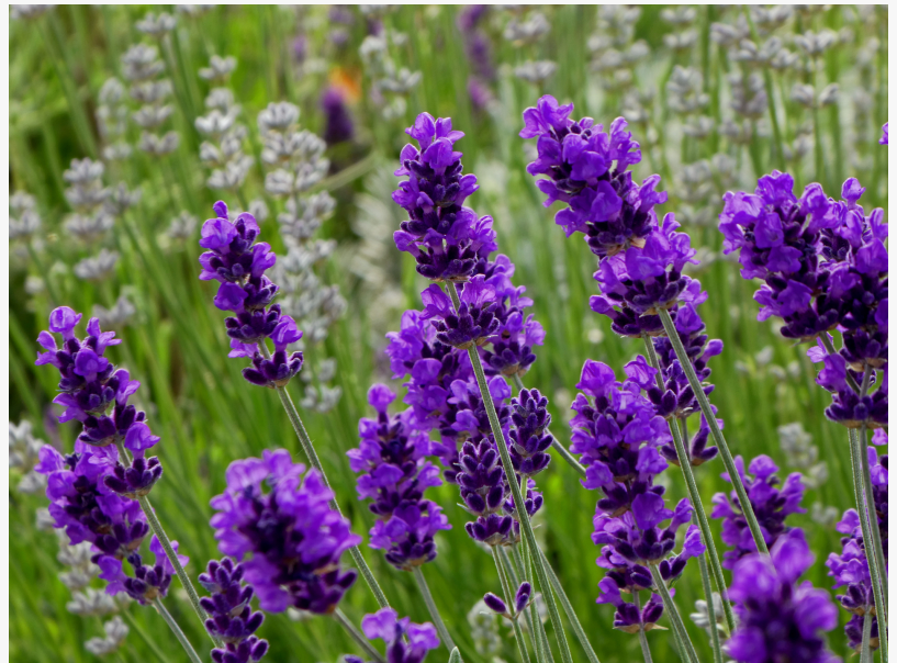
FlowerKisser After Midnight English Lavender is the 2019 Plant of the Year from High Country Gardens.