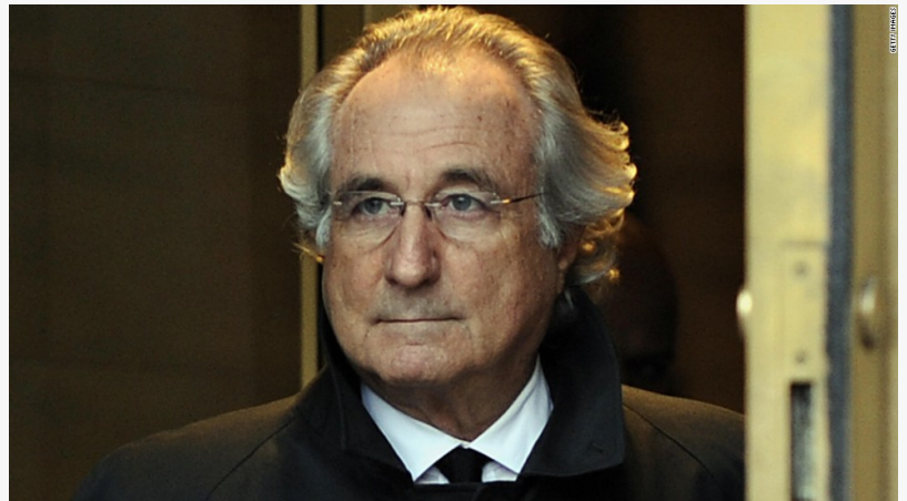
Bernie Madoff serving 150 years in prison for running a multi-billion dollar Ponzi scheme.