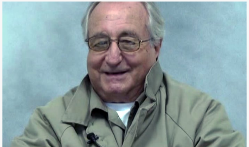
Wall Street legend who ran the largest financial fraud in US history