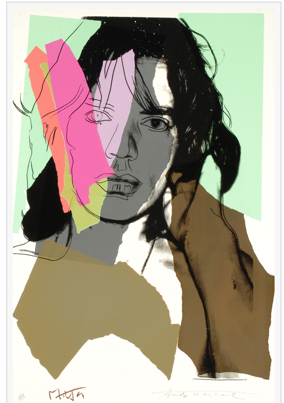
Mick Jagger, 1975 (#140) hand-signed screenprint, 43.5 x 29 inches

understandable. He made this niche for himself in the culture. As much as Mickey Mouse had...putting him on a dollar bill was making him even more like an icon or part of the American dream.' -Haring from Haring, Warhol, Disney