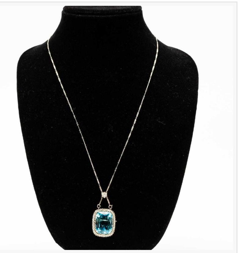
14kt white gold aquamarine and diamond necklace set with a 38-carat aquamarine (est. $25,000-$35,000).

The Saturday-Sunday auction will be packed with 1,144 quality lots, mostly pulled from prominent local estates and collections. Included will be lovely period antiques, fine art by noted artists, silver, Asian arts, period furniture, fine estate jewelry and more. Online bidding is provided by