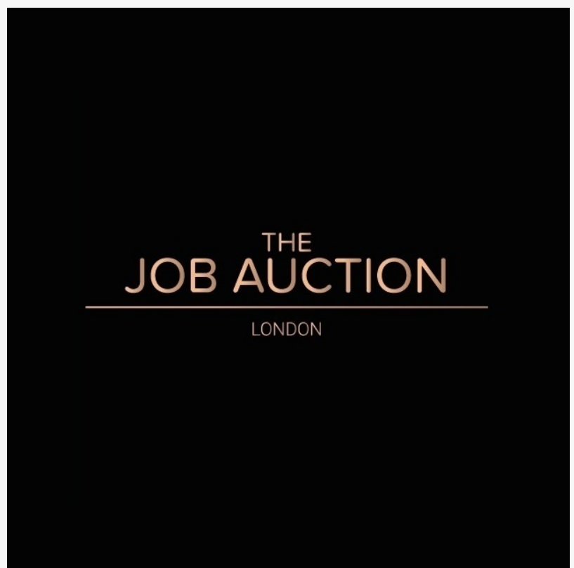
The Job Auction

While the comparison to Berlin's definitions of liberty is rudimentary and unpolished the levels of influence and therefore aid you can get from The Job Auction team is entirely up to you, meaning freedom to achieve is on offer as is freedom from constraints. The CV Clinic, a place where you can have a team of experts advise you on how to tweak your CV for