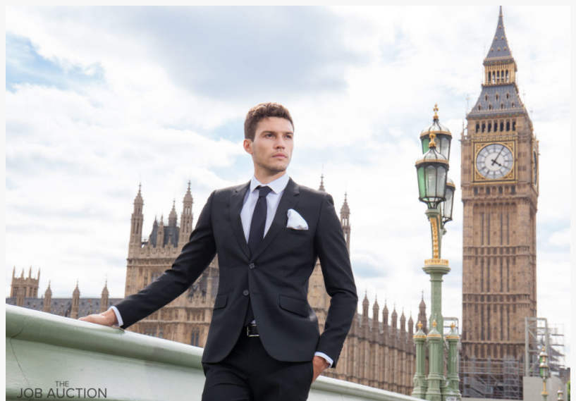
The Job Auction