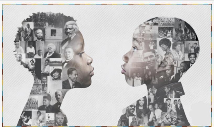
Learn Black History. Teach Black History. Create Black History

In the words of of the late Arthur Fletcher - former head of the United Negro College fund, "A mind is a terrible thing to waste!"