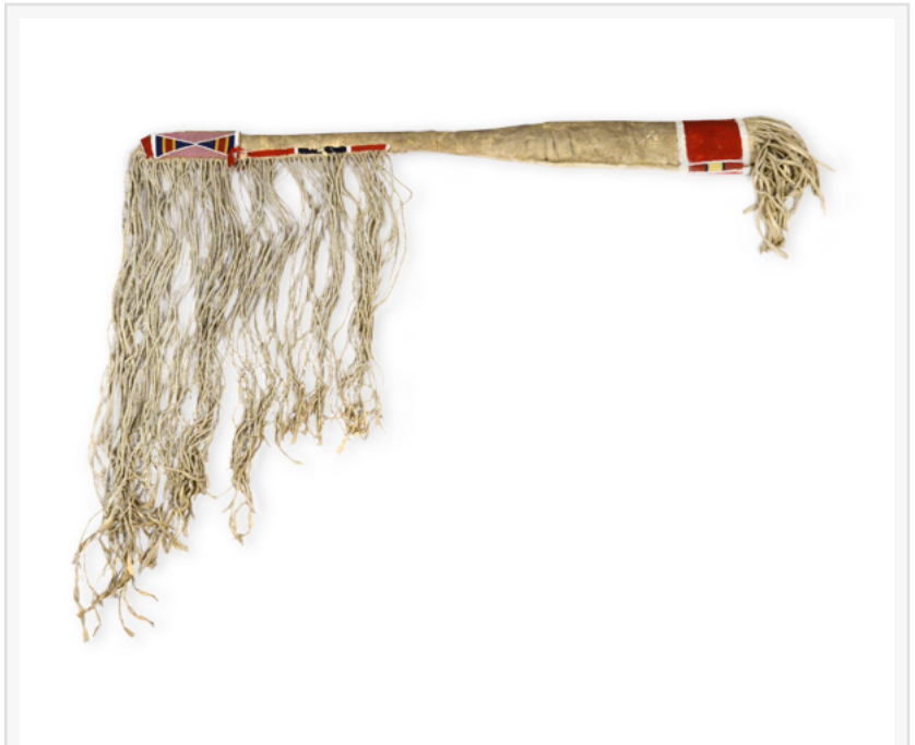
Northern Plains/Crow buffalo hide rifle scabbard with seed and pony beads, body and fringe buffalo hide.