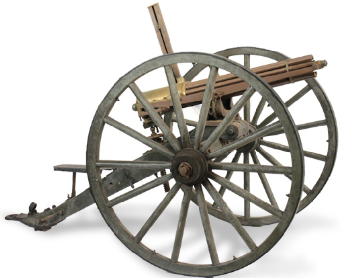
Colt Manufacturing Company Model 1875 Gatling Gun, .45 caliber and marked "NJ".