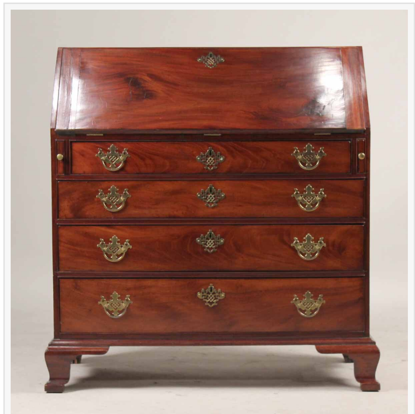
Chippendale mahogany slant-front desk attributed to John Townsend (Newport, R.I.), circa 1760-1775.