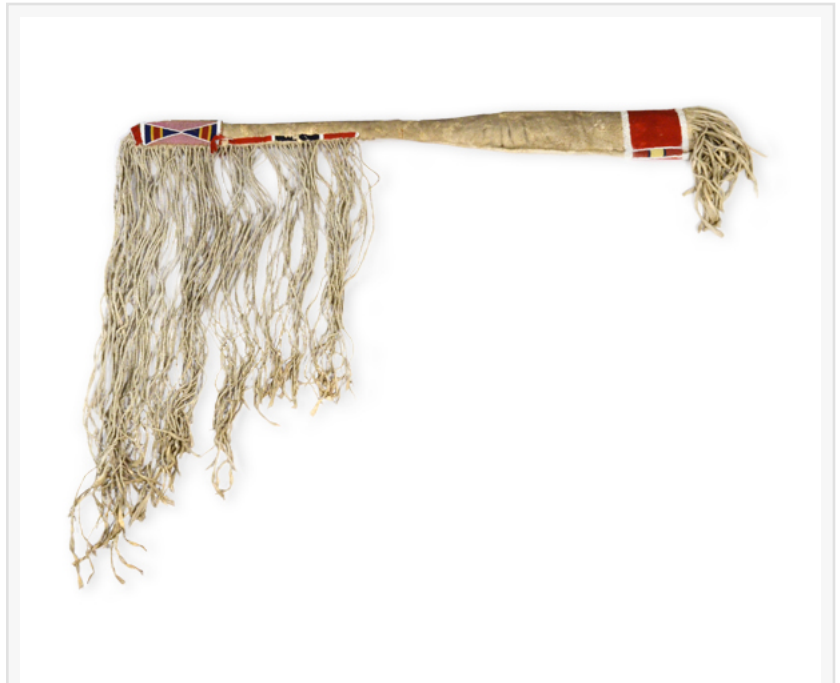
Northern Plains/Crow buffalo hide rifle scabbard with seed and pony beads, body and fringe buffalo hide.