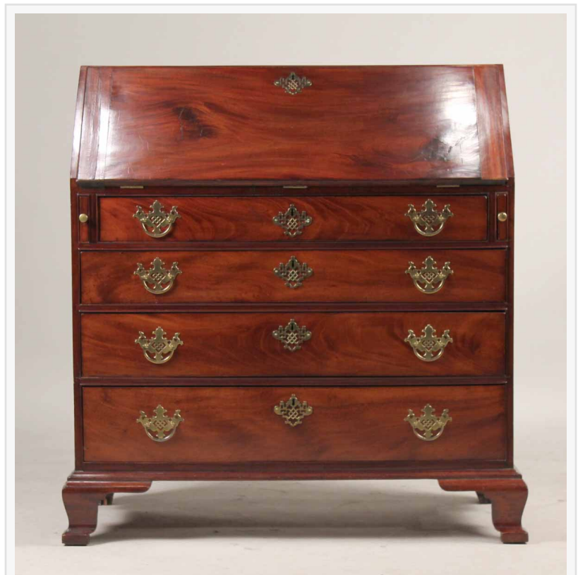
Chippendale mahogany slant-front desk attributed to John Townsend (Newport, R.I.), circa 1760-1775.