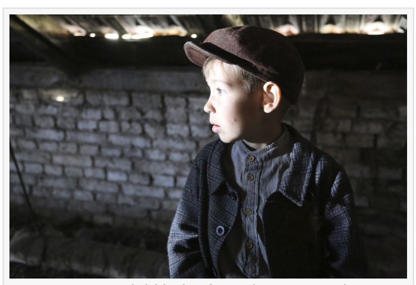
During WWII, a child hides from the Nazis at the HKP labour camp. (Recreation at the actual site)