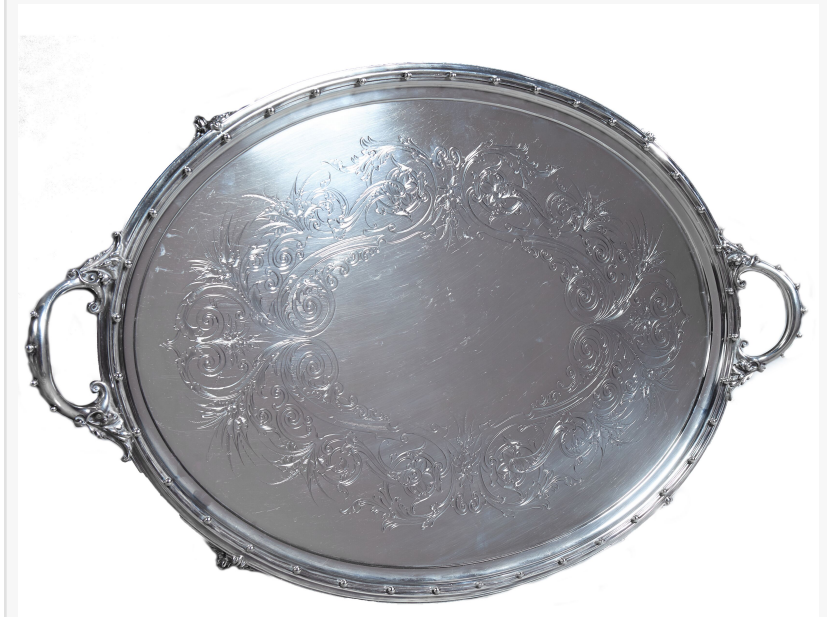
Beautiful mid-19th century American coin silver serving tray by Gorham, 199.8 troy ounces (est. $3,000-$5,000).