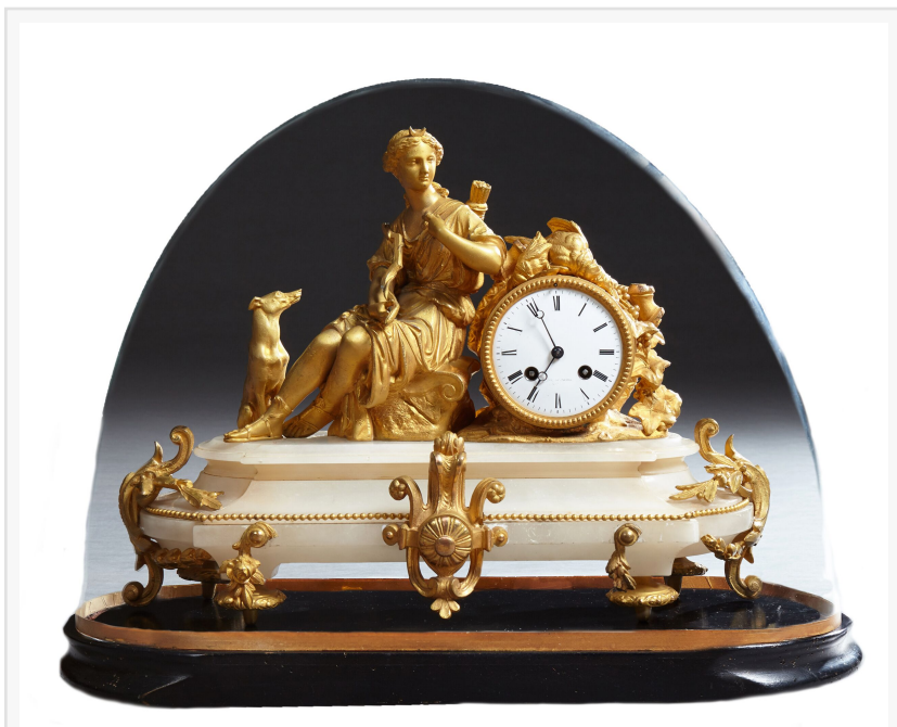
Stunning 19th century Napoleon III gilt bronze and alabaster clock, depicting Diana, Goddess of the Hunt (est. $800-$1,200).

Sully Hildebrand Crescent City Auction Gallery +1 504-529-5057 email us here