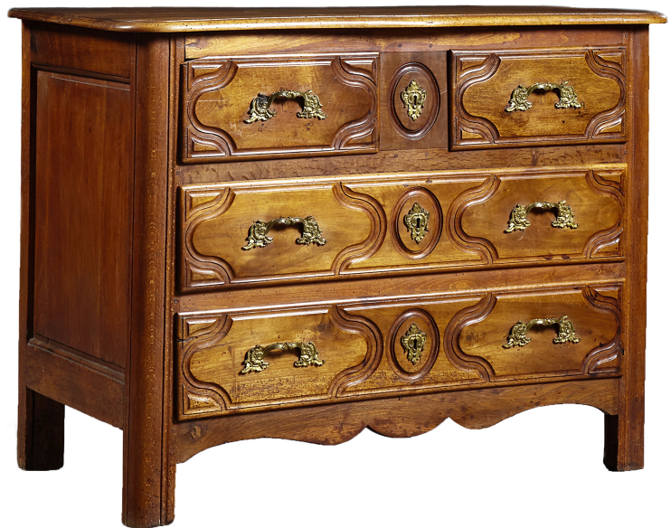
Gorgeous 19th century carved cherry Louis XVI-style bowfront commode (est. $1,500-$2,500).