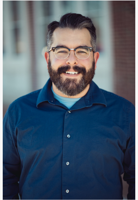
Author Of The Book For Plumbing & HVAC Contractors

This press release can be viewed online at: http://www.einpresswire.com