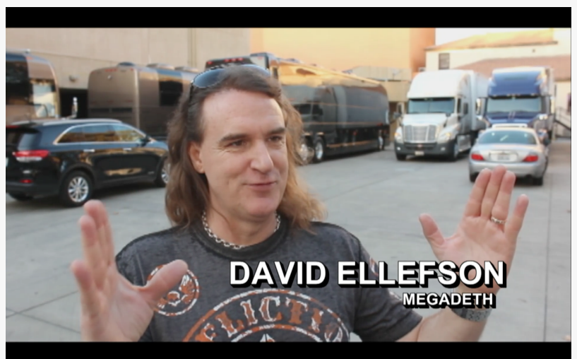
David Ellefson of the Grammy Award-winning band Megadeth is one of the many musicians featured in the film BAND VS BRAND.

The documentary focuses on the current state of the music business and on how "the brand" of a rock group these days has more power than the band members themselves. Tickets for the awards gala are $30 each with the movie premiere open to the general public, free of charge.