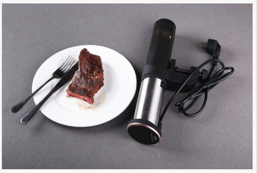
The Surfit Sous Vide Cooker makes it easy to achieve professional-level cooking results.

GenHigh's mission is to provide consumers worldwide access to highquality, elegantly-designed smart devices engineered with the latest innovations in technology matched with precision craftsmanship. We are headquartered in China. GenHigh was founded in 2017 with operations in the US and Japan. GenHigh is committed to our goal of connecting consumers &