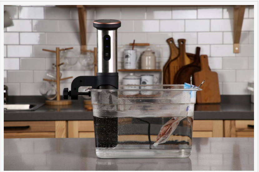
Surfit Sous Vide Cooker enables you to cook your favorite foods to perfection and enjoy fine dining at home.

Unlike traditional sous vide cookers available on the market, Surfit Sous Vide is compliant with IPX7, which means the device is protected from immersion in water with a depth of up to 1 meter (3.3 ft). Also, the cooker can be easily cleaned thanks to its removable bottom part that can be rinsed or cleaned with dish soap.