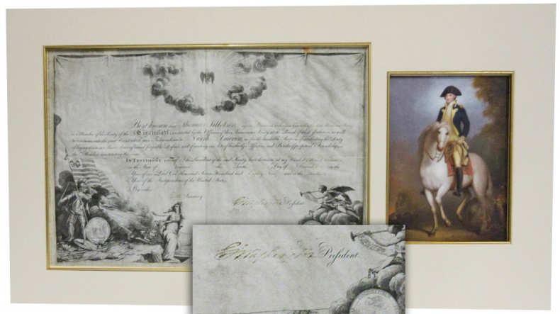
George Washington signed document from 1785, endorsing a Rev-War-era surgeon (est. $12,000-$14,000).