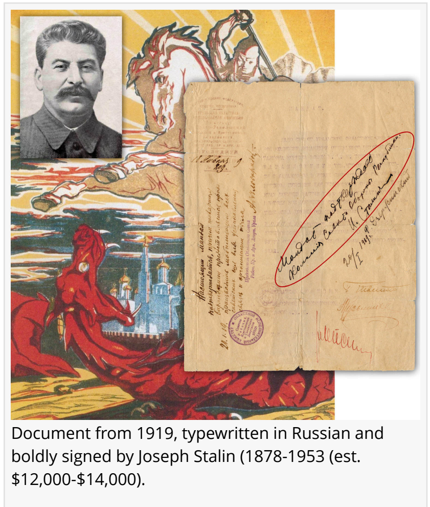
Document from 1919, typewritten in Russian and boldly signed by Joseph Stalin (1878-1953 (est. $12,000-$14,000).