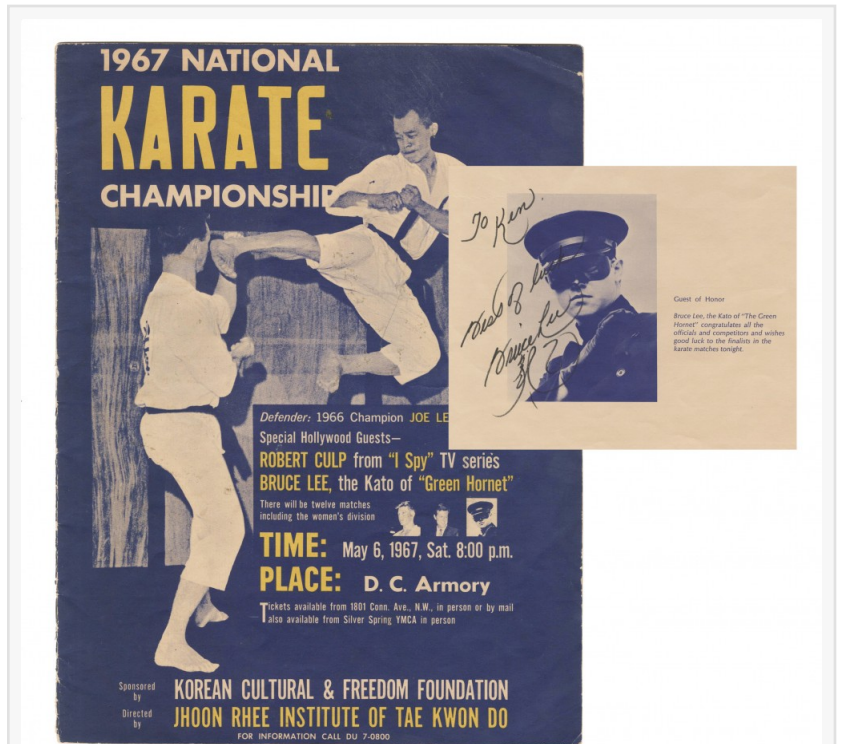
Signed image of Bruce Lee, pictured as "Kato" from The Green Hornet (est. $15,000-$17,000).

Rounding out just a couple more highlights from the catalog, one of the finest known signed images of Bruce Lee , pictured as “Kato” from The Green Hornet in a program guide for the National Karate Championship of 1967, inscribed to a fan, is expected to hit $15,000-$17,000; while a document twice-signed in 1791 by John Marshall, while Secretary of State under John