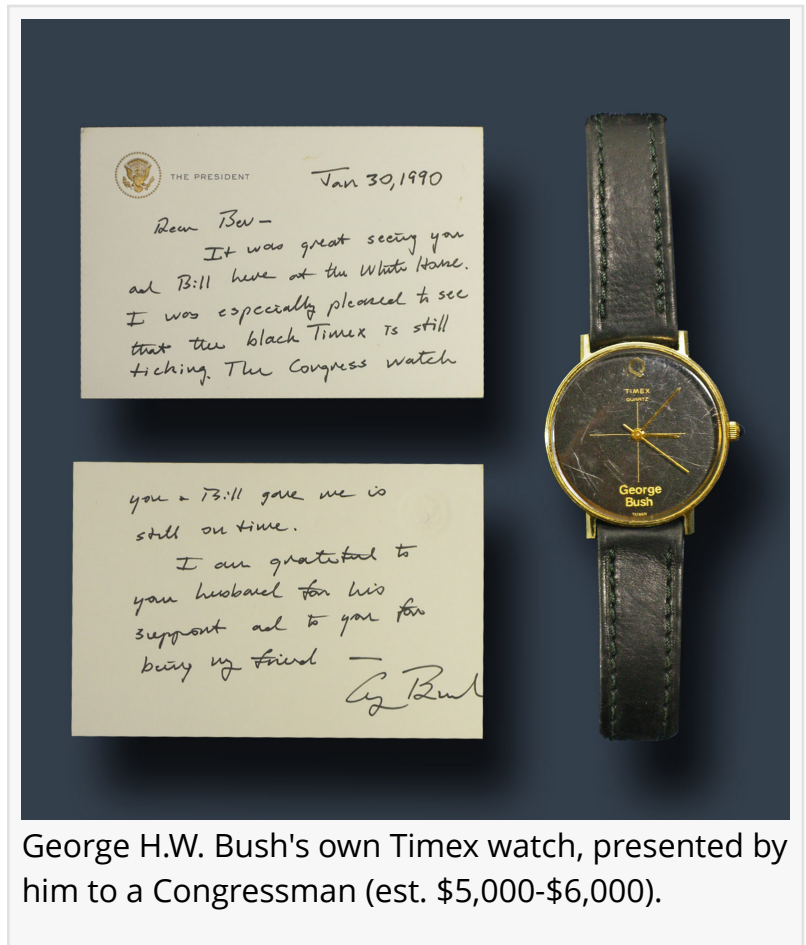
George H.W. Bush's own Timex watch, presented by him to a Congressman (est. $5,000-$6,000).

A unique Lincoln Memorial dedication program signed by four U.S. Presidents and more than 30 Lincoln scholars, artists and other important attendees is bound to attract keen bidder interest. The handsome, oversized presentation album is hand-signed by former President William H. Taft, Warren G. Harding (the sitting president at the time), and future presidents Calvin Coolidge and Herbert Hoover. Measuring 10 ¾ inches by 13 inches, the book should bring $6,000-$7,000.