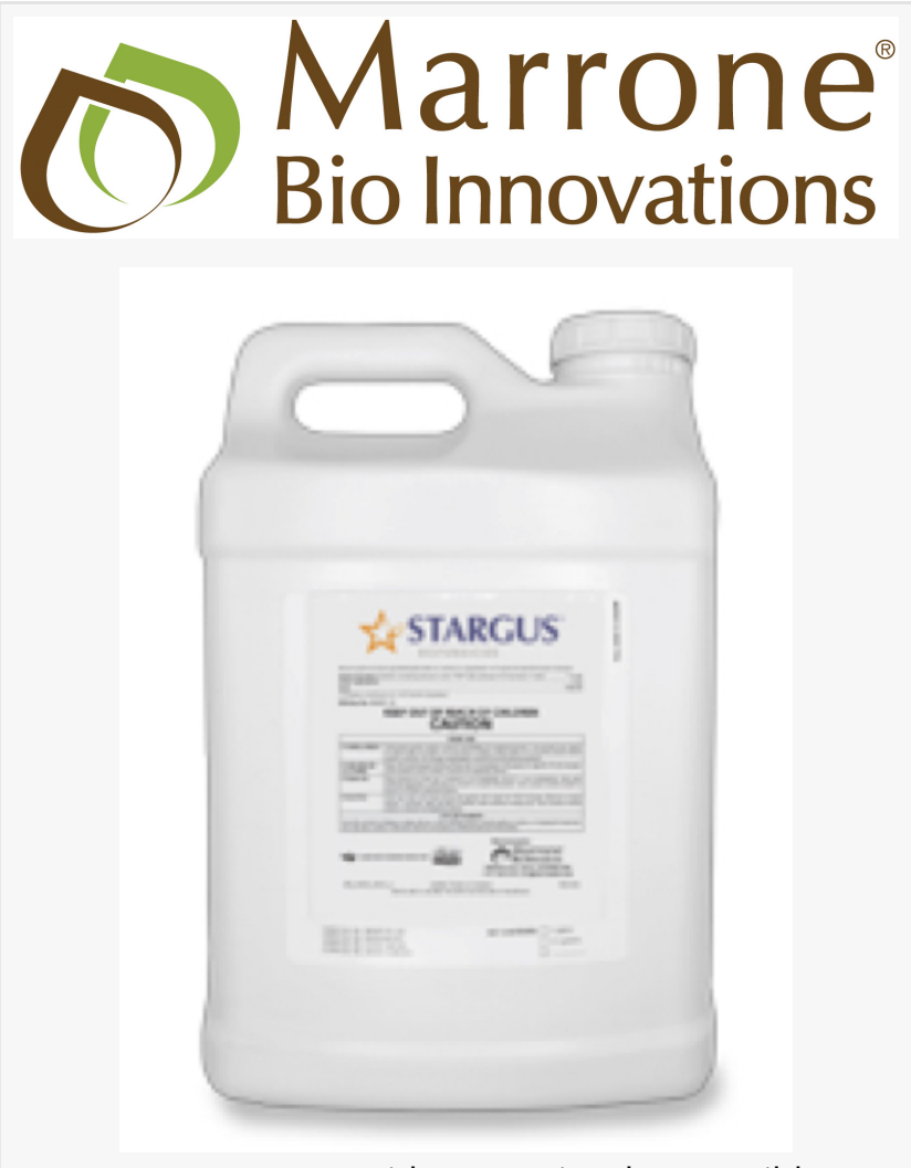
Stargus (MBI-110) provides superior downy mildew and white mold control

According to Phillips McDougall, the Canadian pesticide market totaled $1.7 billion in 2016 and is expected to grow at a CAGR of 2.3% to $1.9 billion in 2021. While market figures for the $2-3 billion global biostimulant market do not break out Canada, growth of biostimulants in Canada, which includes products like Haven, in Canada follows the growth trends of the rest of the world at a 10-12% CAGR.