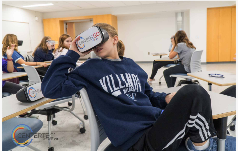
high school student using centertec go in class

This press release can be viewed online at: http://www.einpresswire.com