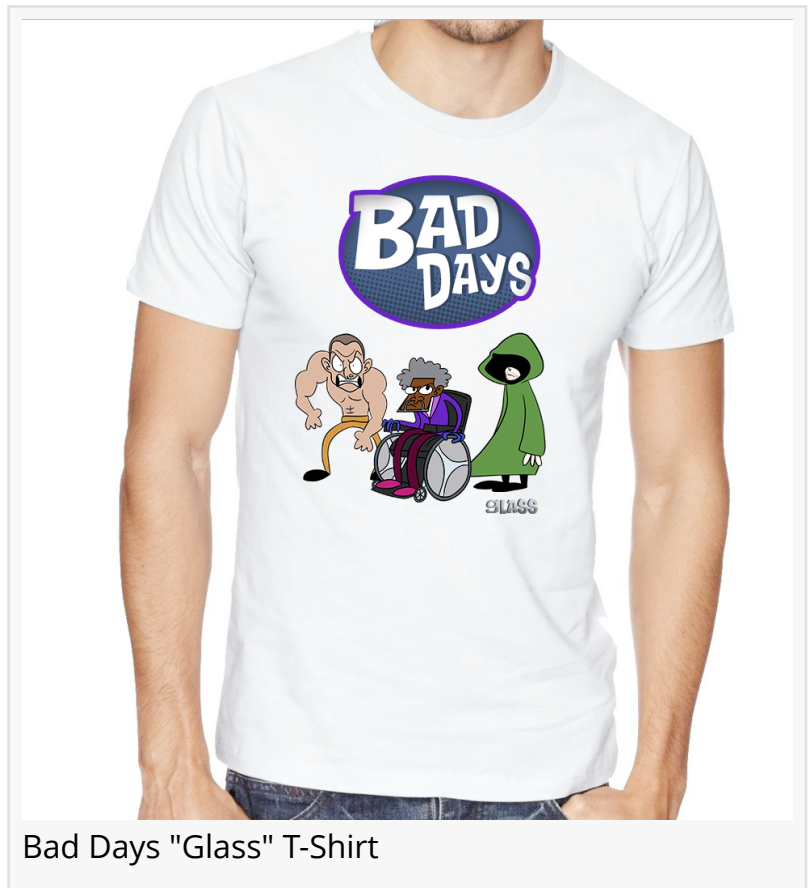
Bad Days "Glass" T-Shirt