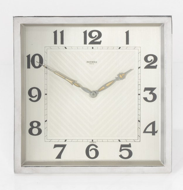
Hermes Art Deco table clock, circa 1925 (est. $2,000-$3,000).