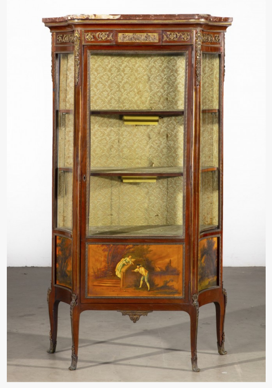
French walnut and Vernis Martin vitrine, circa 1900 (est. $800-$1,200).

auction houses in America and Europe, scouring property from across North America. The firm's auctions are diverse and eclectic and feature fine items in many collecting categories spanning