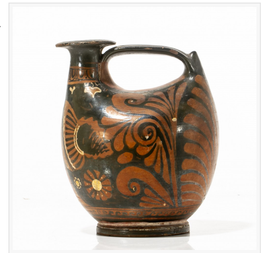
Ancient Greek red figure askos, circa 4th century BCE (est. $700-$900).

Aileen Ward Andrew Jones Auctions +1 213-748-8008 email us here