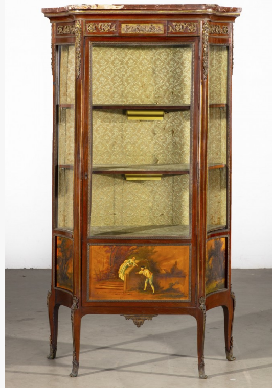
French walnut and Vernis Martin vitrine, circa 1900 (est. $800-$1,200).