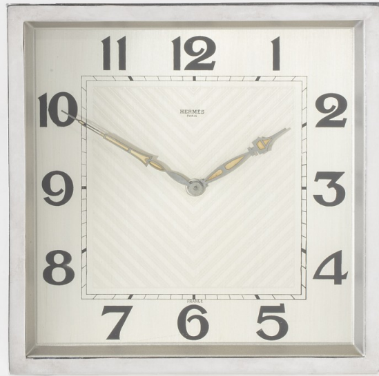
Hermès Art Deco table clock, circa 1925 (est. $2,000-$3,000).

DTLA Collections and Estates is the venue to find statement pieces, quirky accents or even re-design an entire room in an affordable, sustainable way. The public preview opens 10 a.m. to 5 p.m. Pacific time, from Jan. 17-19. Andrew Jones Auctions opened in summer 2018 and is the only full-service fine art and antiques auction house in downtown Los Angeles. The staff has a wealth of knowledge and international experience, having worked for many years at major auction houses in America and Europe, scouring property from across North America. The firm's auctions are diverse and eclectic and feature fine items in many collecting categories spanning