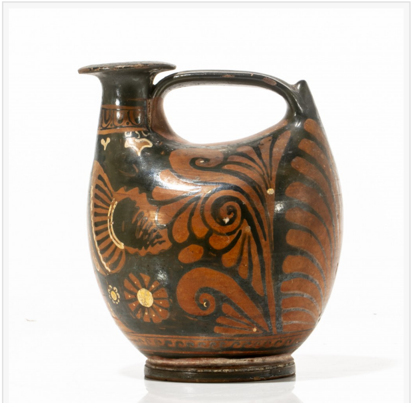
Ancient Greek red figure askos, circa 4th century BCE (est. $700-$900).

Aileen Ward Andrew Jones Auctions +1 213-748-8008 email us here