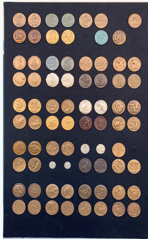
Display board containing a near-complete set of the first 40 issues of the Society of Medallists, 1930-1949 (est. $2,000-$4,000).