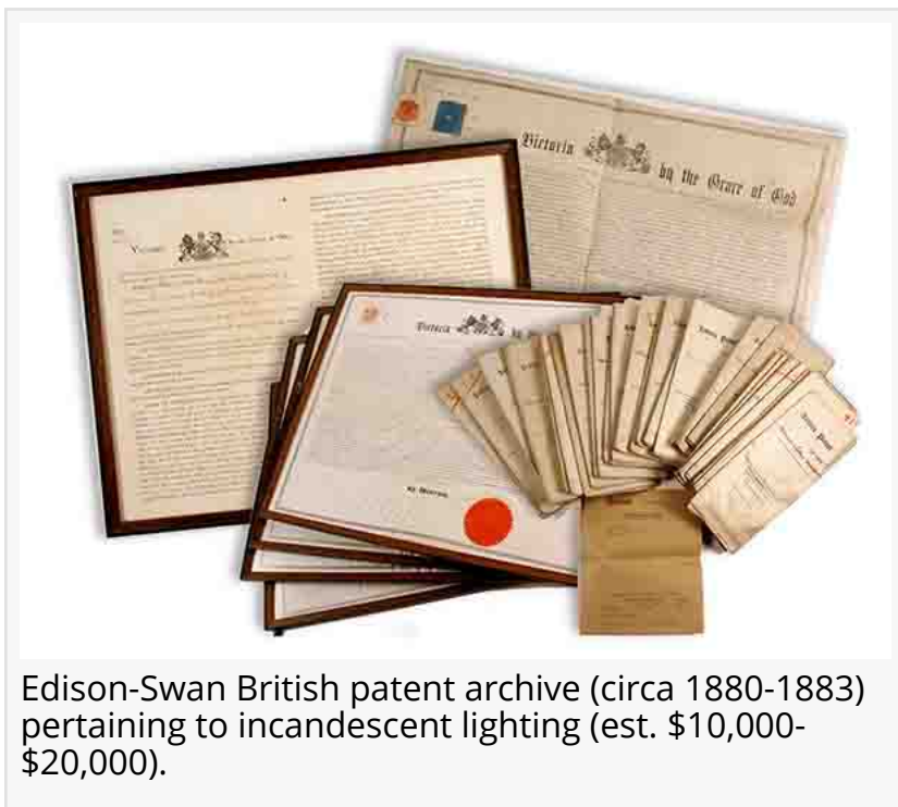
Edison-Swan British patent archive (circa 1880-1883) pertaining to incandescent lighting (est. $10,000-$20,000).

Other star lots on Day 1 promise to be a complete set of eleven five-ounce 999 silver medallions marking the 50th anniversary of the release of Walt Disney’s Snow White and the Seven Dwarfs, from 1987 (est. $1,700-$3,000); and an historic 500-troy ounce bullion scale made by Troemner out of Philadelphia for the U.S. Mint, with the original blue paint and base (est. $7,500-$10,000).