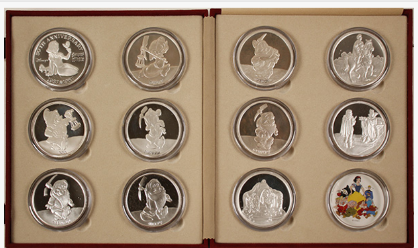
Complete set of 11 five-ounce 999 silver medallions for the 50th anniversary of Snow White and the Seven Dwarfs (est. $1,700-$3,000).

Additional mining lots will feature art, assay, bonds, books, hats, ingots, jewelry, fobs, maps, photos and postcards. Day 3 will also include transportation, Wells Fargo/Express, postal history items, military collectibles and more. One of the more intriguing lots is a baby stingray fossil,