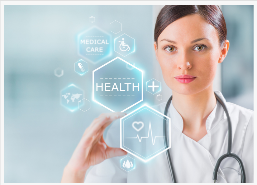
Remote Caregivers Release Medications

CRAIG LINDEN REALTIMETOUCH.COM +1 619-301-3555 email us here