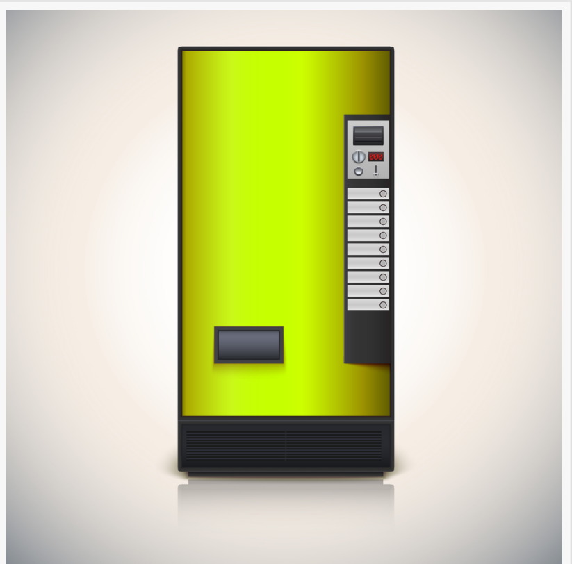
Remote Controlled Rx Dispenser

Reducing Hospital Readmissions - https://www.youtube.com/watch?v=VXkrDXk5rmo