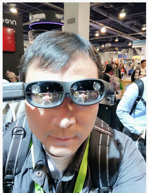
Nreal has privacy and comfortability falw, its design do not work in real life

6) Nreal used the so-called "Birdbath" optics architect, which is complicated and not the simplest possible high image quality, large Field of View optical deign form. It is cheaper than the $2300 MagicLeap waveguide though, but Nreal's $999 price tag are still out of the reach of ordinary consumer.