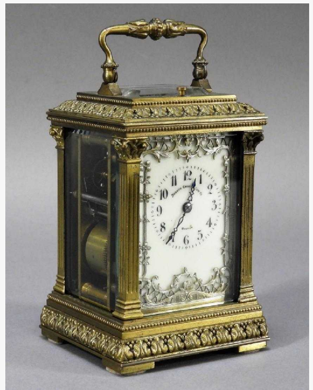
19th century French repeater carriage clock with silver overlay dial, signed "Aiguilles" (est.; $1,500-$2,500).