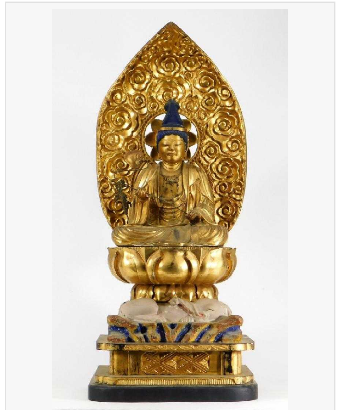
Japanese Meiji period gilt and lacquered Buddha on an elephant base, 28 inches tall (est. $2,000-$3,000).

Travis Landry Bruneau & Co. Auctioneers +1 401-533-9980 email us here