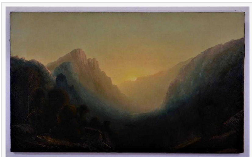
Oil landscape painting attributed to Hudson River School artist Albert Bierstadt (German-American, 1830-1902) (est. $6,000-$9,000).

There is a small selection of antique petroliana and advertising highlighted by a circa 1940s Sunoco Walt Disney Donald Duck cardboard poster and a circa 1940s Shell pecten embossed porcelain neon skin sign. The Donald Duck Sunoco sign ("Keeps Motors Knockless!/25 Cents a Can") measures 59 ½ inches by 38 ¾ inches (est. $2,000-$3,000).