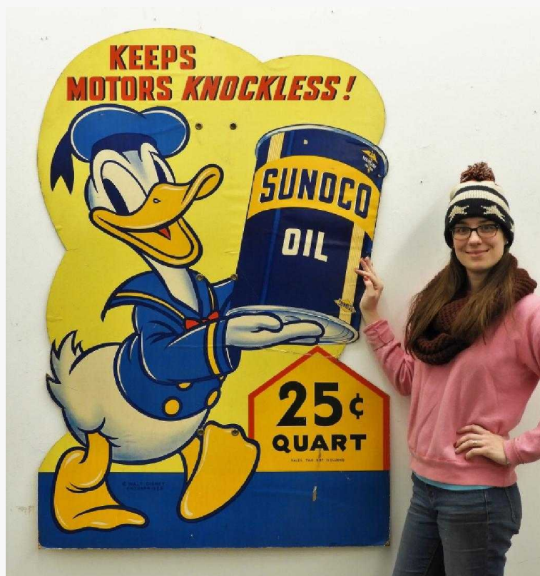
Circa 1940s Sunoco Walt Disney Donald Duck cardboard poster advertisement (est. $2,000-$3,000).