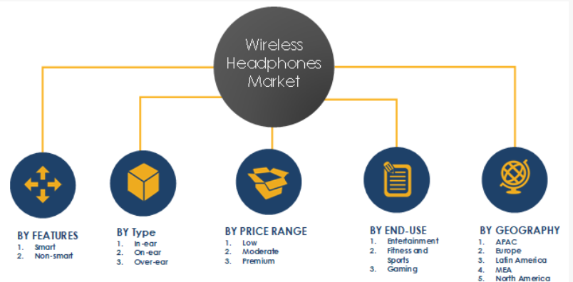
Wireless Headphones Market Share and Segments Chart

Wireless Headphones Market – Segmentation