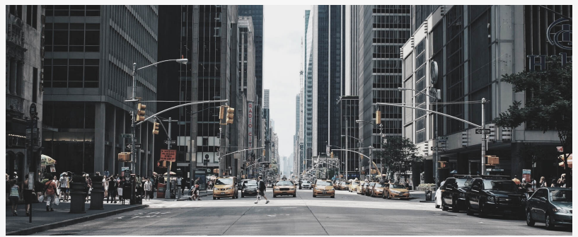
Friendly TLC Rentals & Leasing

However, rideshare coverage does not protect you in case of an accident when the passenger is injured. Lying to your insurance company about the situation is a non-starter as well since if they find out, they will cancel your coverage. Plus, it is insurance fraud which is a felony.