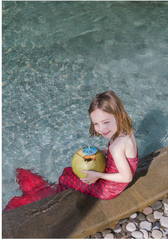
The Ritz Kids Aquatic Goddess Program nurtures a child's creative spirit