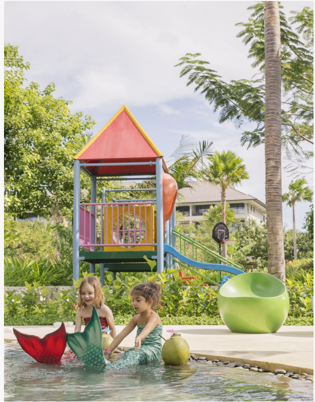
A fun experience at Ritz Kids pool