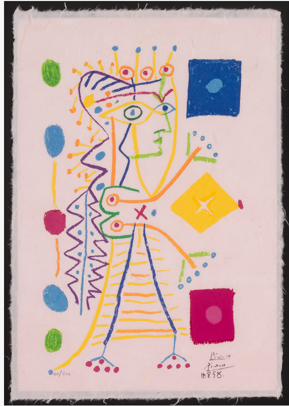
Color lithograph after Pablo Picasso (Spanish, 1881-1973), titled Jacqueline (est. $4,000-$6,000).