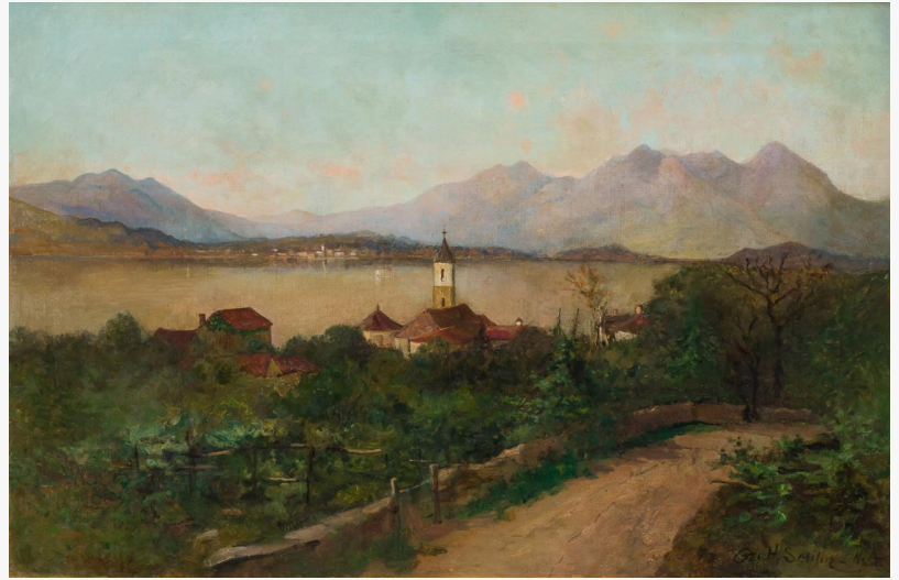
Oil on canvas signed by George Henry Smillie (American, 1840-1921), titled River Landscape with Mountain View (est. $3,000-$5,000).