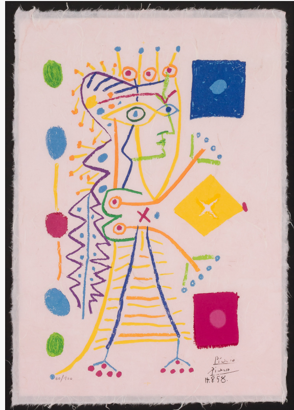
Color lithograph after Pablo Picasso (Spanish, 1881-1973), titled Jacqueline (est. $4,000-$6,000).