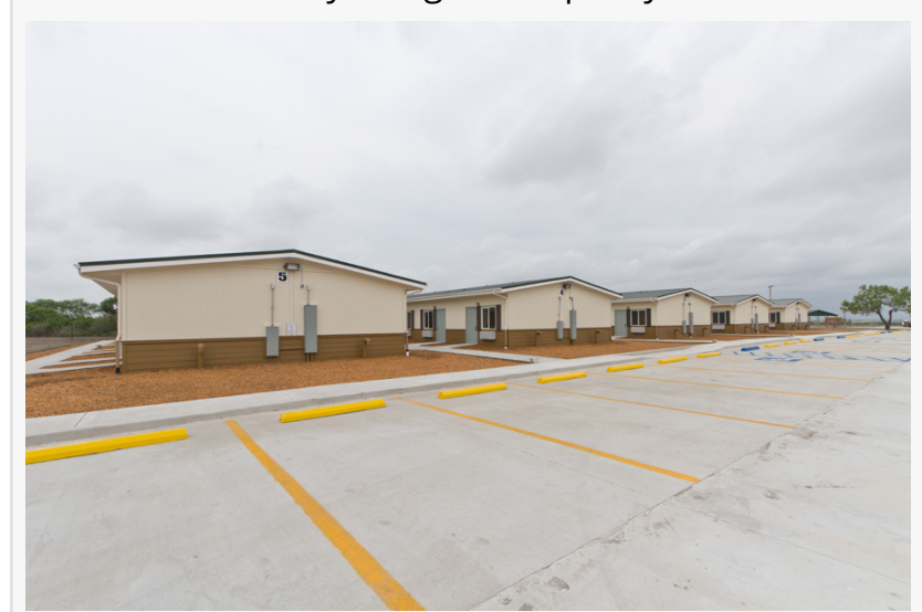
Modular Dormitories - Exterior View

This press release can be viewed online at: http://www.einpresswire.com