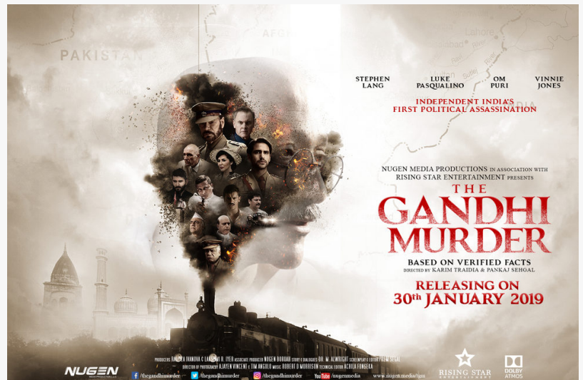
Official Poster : The Gandhi Murder