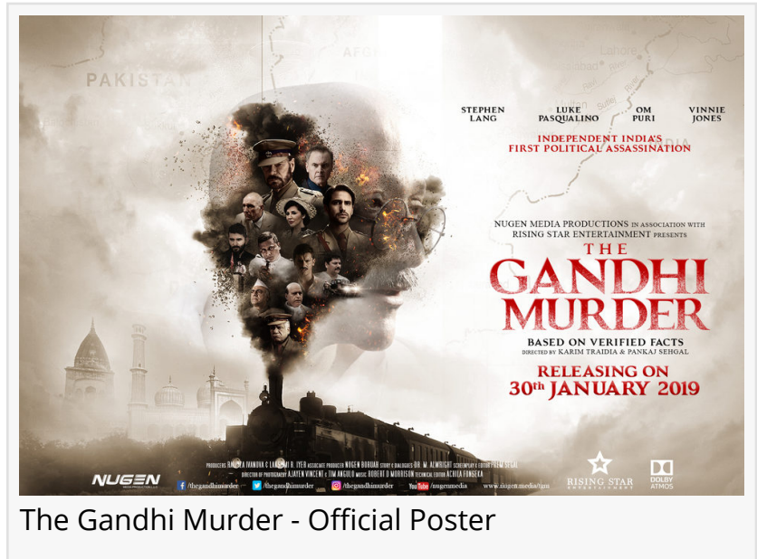
The Gandhi Murder - Official Poster

Everyone concerned with a better future for mankind must be deeply moved by the tragic death of Gandhi. He died a victim of his own principle, the principle of non-violence. He died because in a time of disorder and general unrest in his country, he refused any personal armed protection. It was his unshakable belief that the use of force is an evil in itself, to be shunned by those who strive for absolute peace.