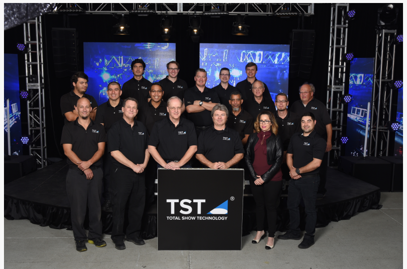
Total Show Technology Team - Las Vegas, NV

TST's initial trade show focus has expanded over the years to corporate meetings and events and nightclub live events. The new name reinforces the depth and breadth of the company's capabilities, combined with the company's increasing domination in the Las Vegas and Pacific Southwest AV production markets.