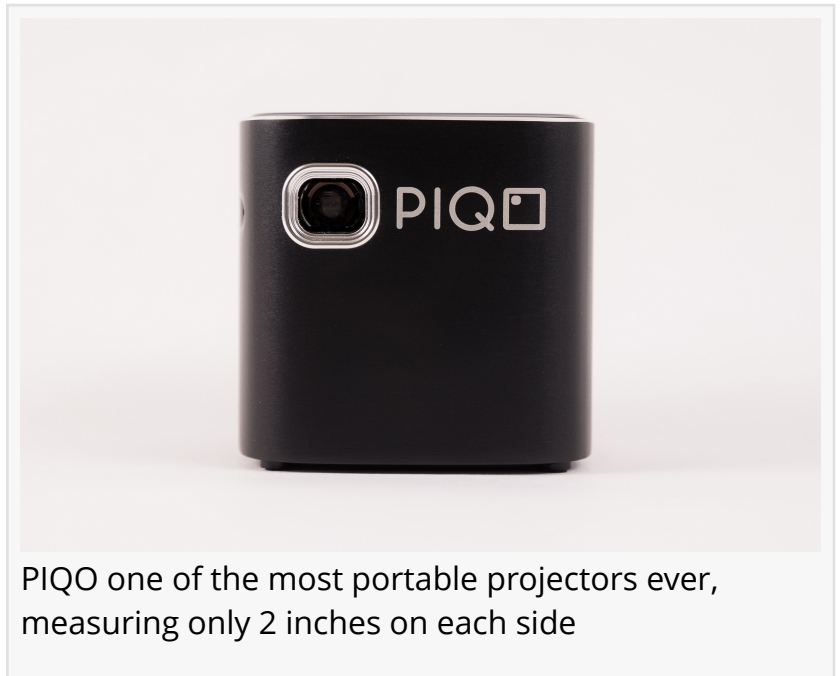
PIQO one of the most portable projectors ever, measuring only 2 inches on each side

LOS ANGELES, CALIFORNIA, USA, January 21, 2019 /EINPresswire.com/ -- PIQO is an industry-topping portable projector that puts the computing power of an iPhone X, the sound quality of Bose, and the crystal-clear picture of an LED TV in your pocket. PIQO has blown past over USD$1,000,000 in funding on the popular crowdfunding site, Indiegogo , with over 3,000 backers supporting the campaign.