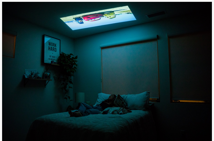
Enjoy PIQO anywhere - Perfect especially for bedtime screenings