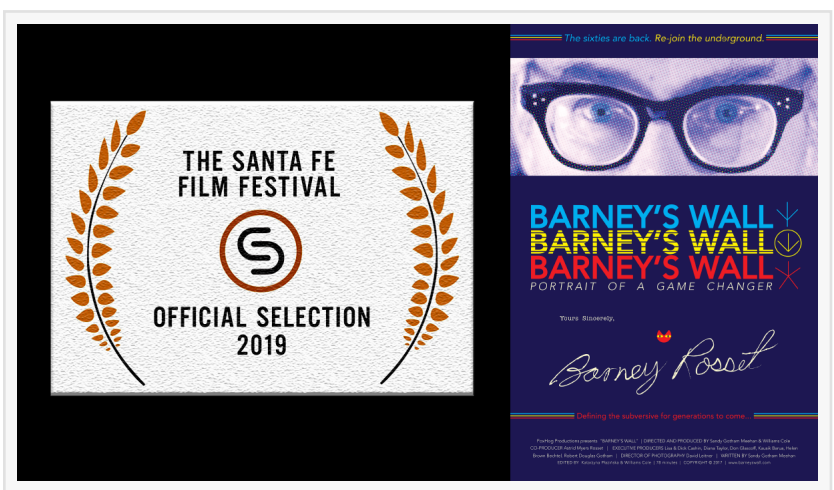
"It is a symphony... an epic novel on a wall"—WALL STREET JOURNAL

SANTA FE, NEW MEXICO, USA, January 23, 2019 /EINPresswire.com/ -- A timely new feature documentary, BARNEY'S WALL: Portrait of a Game Changer, premieres at the Santa Fe Film Festival on February 14, 2019, at 6:00pm. The film probes the lasting political and cultural impact of BARNEY ROSSET, radical Grove Press publisher, freespeech warrior and political activist, one of the most influential cultural impresarios of the last half of the 20th century. Rosset's fierce mid-century battles against literary censorship,