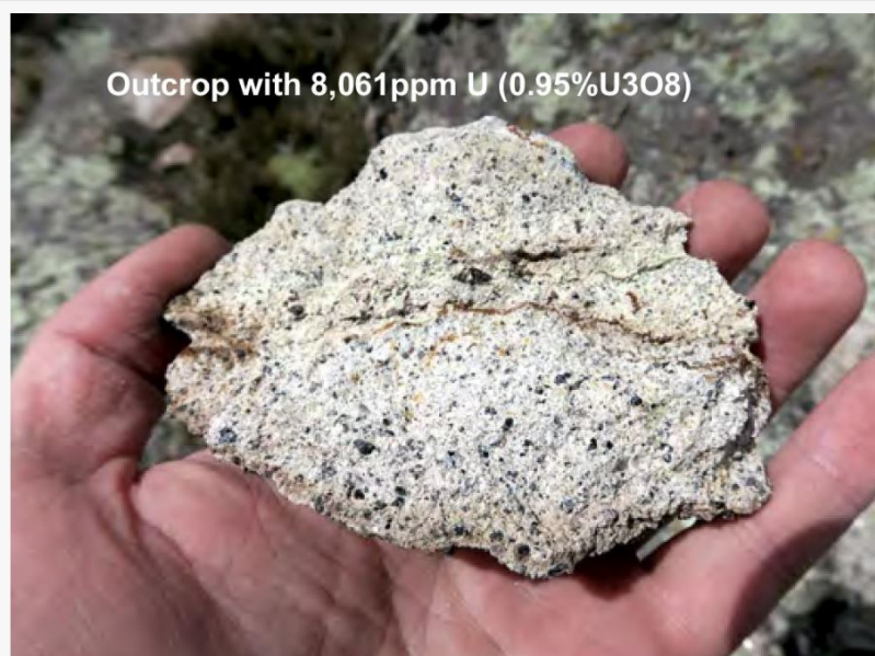
Figure 1: 8,061 ppm Uranium rock sample, 2018 recon program, Escalera Project

"Our maiden reconnaissance survey focused on the three separate project areas, covering much of the combined 7,400 hectares underlain by the target volcanic debris flow rocks," said president and CEO, Alex Klenman. "In a very short time, field crews have successfully identified two areas for prospective uranium mineralization on the large Escalera property. We are particularly pleased that rock grab sampling has yielded rock sample clusters of prospective uranium mineralization over an area extending more than four kilometres. Our next work phase