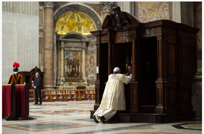
Confession at the Vatican

Pafumi's four books covering the sex abuse crisis in the Catholic Church globally. From today and through the entire month of February, all four of Pafumi's books on Catholic clergy sex abuse and the history of the Church will be offered at substantially reduced prices.