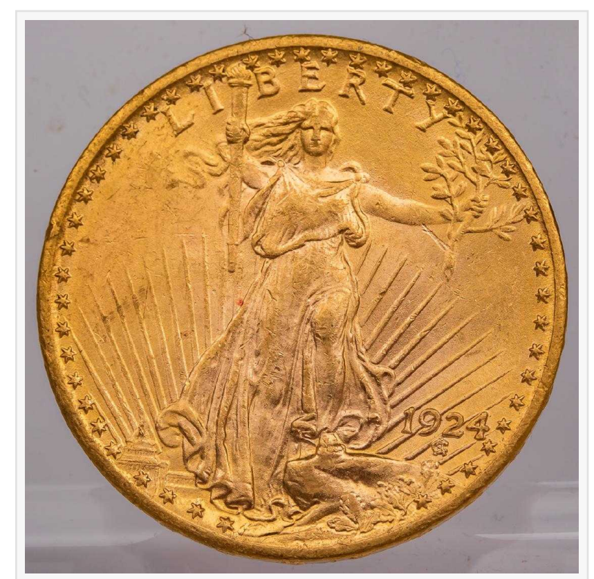
1924 $20 St. Gaudens gold coin, circulated (est. $1,500-$1,700).

Serena Harragin Gray's Auctioneers & Appraisers +1 216-226-3300 email us here