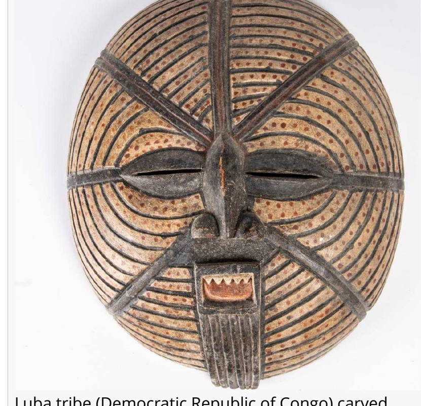
Luba tribe (Democratic Republic of Congo) carved and painted wood moon mask, 20th century, with almond shaped eyes, a small nose and prominent mouth, 17 ½ inches tall (est. $80-$120).

Yoruba tribe (Nigeria) carved wood İbeji female figure, 11 ¼ inches tall; a 20th century Benin brass figure of a seated female, 15 ½ inches tall; and a 20th century carved wood and metal Bamana Ntomo (Mali) mask, 18 inches in height.