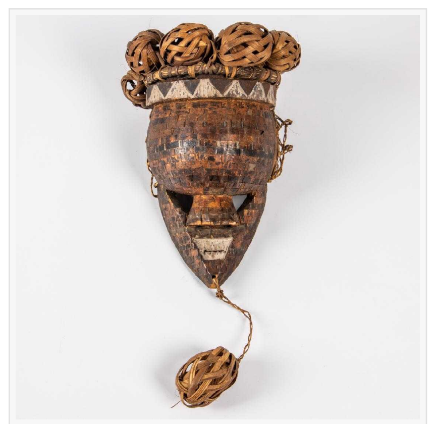
Salampasu tribe (Zaire) carved wood and copper ceremonial mask, 20th century, having fiber ball coiffeur, plaited fiber and ball beard, 19 inches tall (est. $150-$250).

The full catalog is up and pre-bidding is open at GraysAuctioneers.com. Bidding is also available on Liveauctioneers.com and Invaluable.com. Phone and absentee bids will also be accepted. In-person previews will be held Thursday thru Wednesday, Feb. 14-20, from 10-5; and Saturday, February 16th, from noon-4 pm. Gray's gallery, for previews and auction, is at 10717 Detroit Avenue in Cleveland.