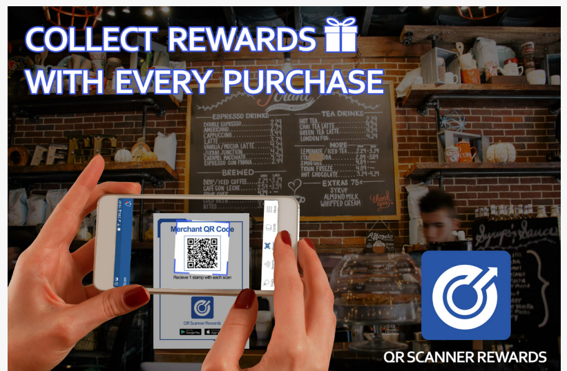
Customer Loyalty App - QR Scanner Rewards