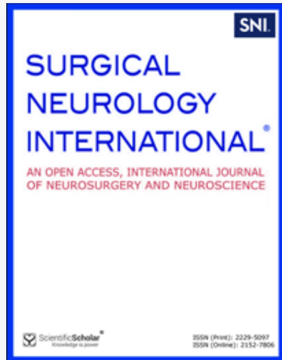
Cover Page of the Journal